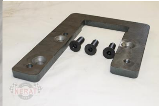
Sample Steering Box Adaptor