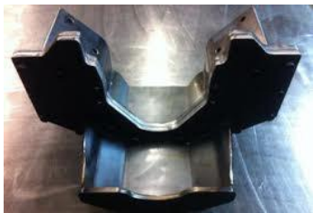
Lower Engine Cradle & Pulley Protector