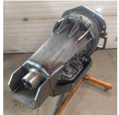
FULL Trans Brace