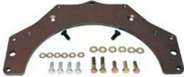
Sample Transmission Adaptor Plate