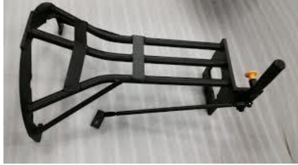
Sample Bar Transmission Protector